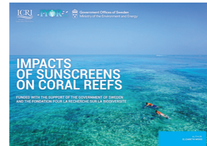
Impacts of sunscreens on coral reefs